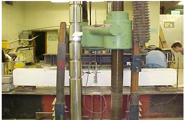
Figure 1. Test Setup

The use of externally bonded Steel-Reinforced Polymer (SRP) and Steel Reinforced Grout (SRG) composites is a promising new technology for increasing the flexural and shear capacities of reinforced concrete (RC) members. The reinforcement system in these composites is a sheet made up of unidirectional cords consisting of tightly wound ultra high strength steel wires. The reinforcement can be molded into resin systems (SRP) or cementitious grout (SRG). This study is aimed at investigating the flexural strength improvement and performance of RC beams with externally bonded SRP and SRG. Eight specimens were tested under four-point bending with variables considered including the level of internal reinforcement, the number of external reinforcement plies, as well as the types of bonding agents.